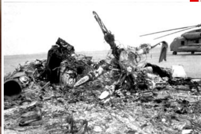
Clockwise from upper left, embassy personnel taken hostage; Time Magazine cover, Nov. '79; wreckage of failed rescue mission; Ayatollah Khomeini